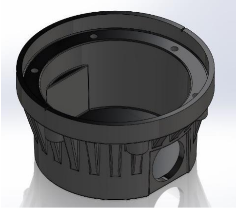
8 INCH SHOLLOW BASE